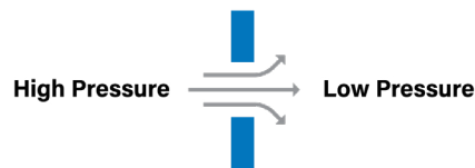
Thin Wall Flow Path (Hole Dia. > 10 x Length)